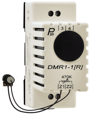
DMR1 - 1 [R]